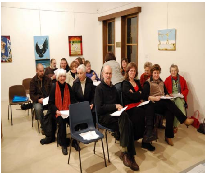
Audience at the CEMA AGM