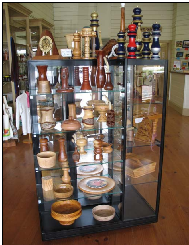
The Wood Turners' Guild's display at The Arts Company