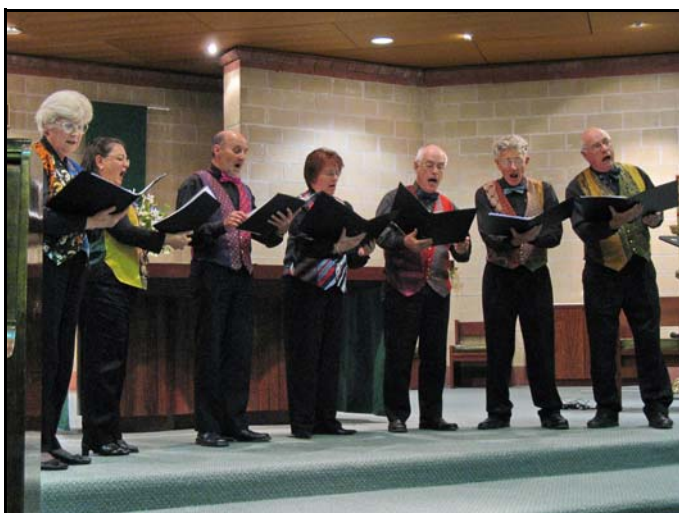
"Aquarelle Sostenuto" at last month's Western District Choral Festival