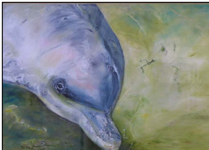
"Dolphin Under The Sea" from Joy Schultz's exhibition at the Portland Arts Centre