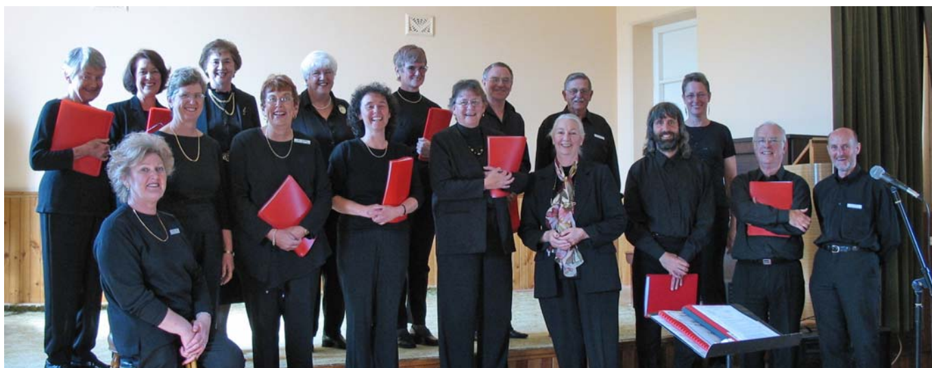
The Portland Choral Group on stage at the Sacred Heart Hall in Casterton for their headline concert on April 9th.