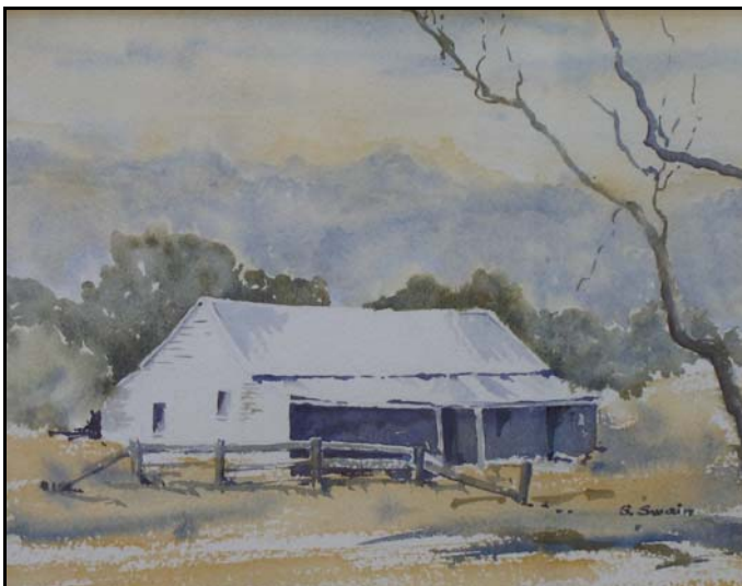
Sheila Swain - "Old House Avoca"