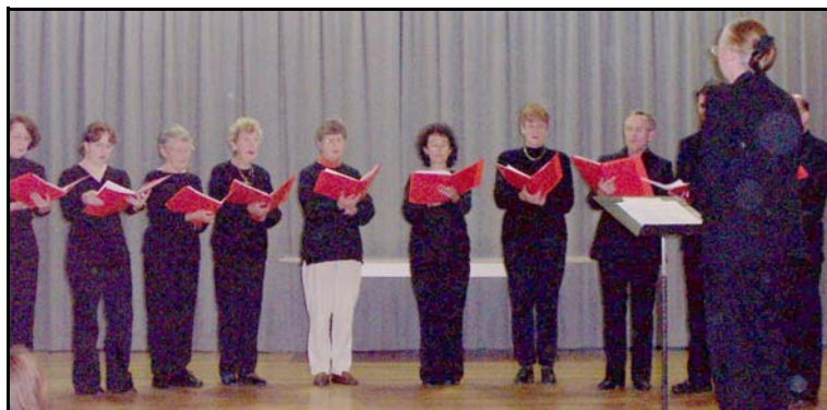
The Choral Group perform at the AGM