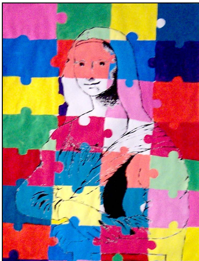
"Mona Lisa Jigsaw" from The Smartie Show, an exhibition of PSC art at the CEMA Arts Centre