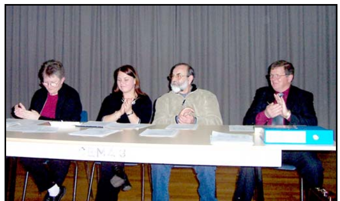
The Outgoing Executive at the AGM