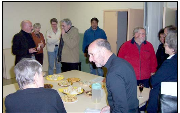
Supper after the AGM

Adults $20 Concession $15 Student $10 Family $52